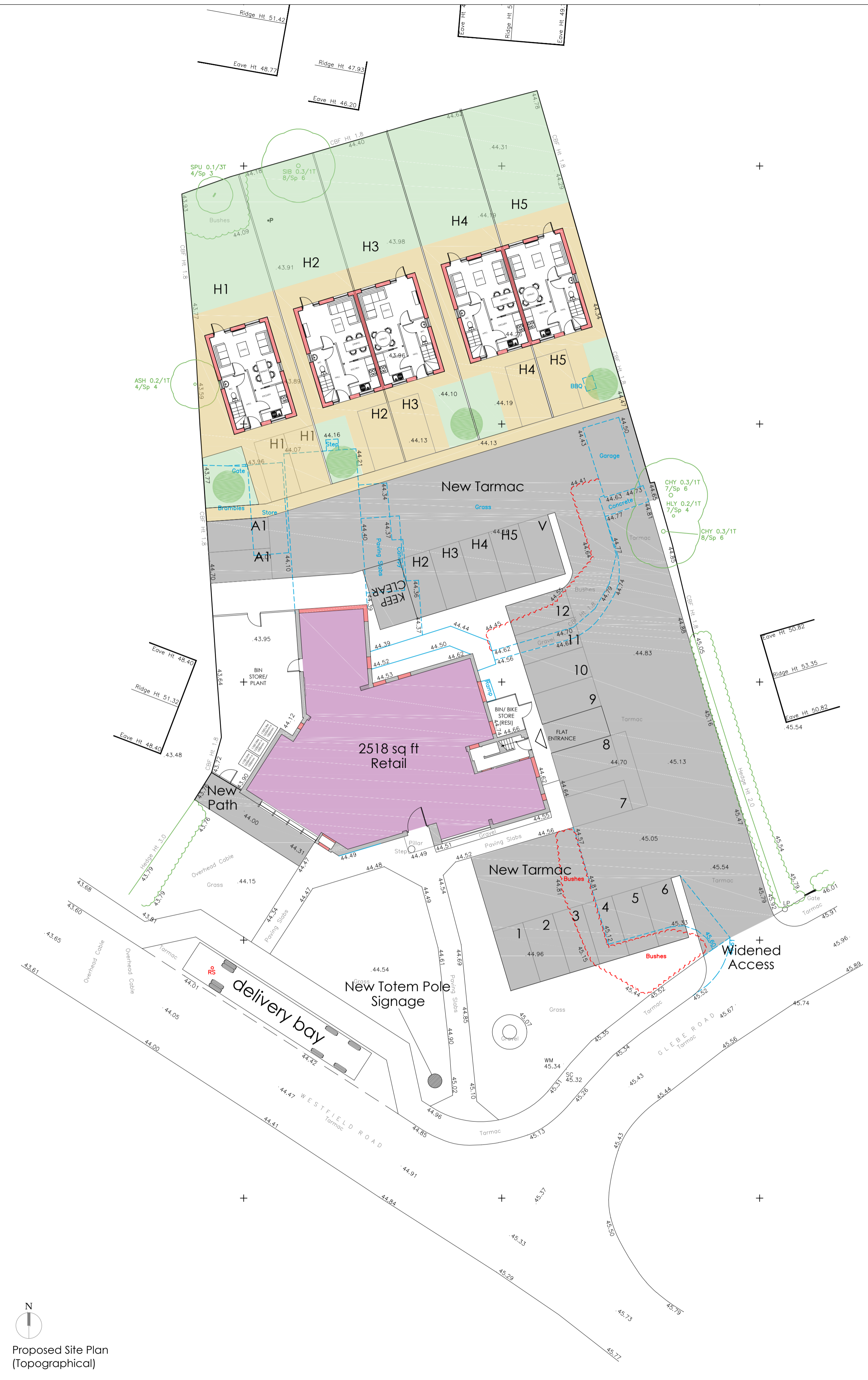
Proposed Site Plan (Topographical)