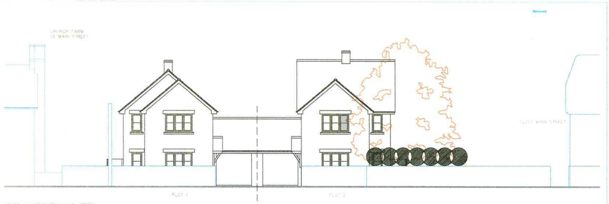
STREET ELEVATION FROM MAIN STREET