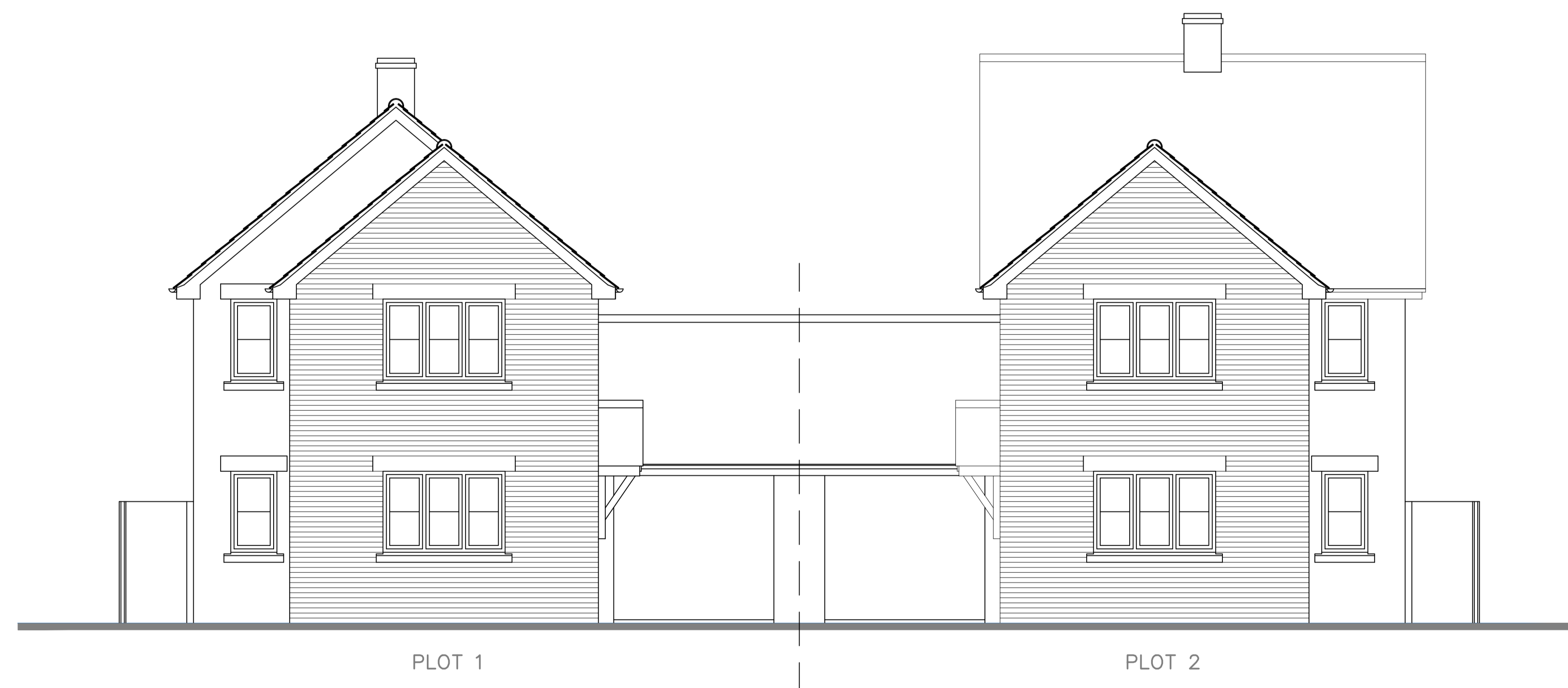
NORTH-EAST (FRONT) ELEVATION