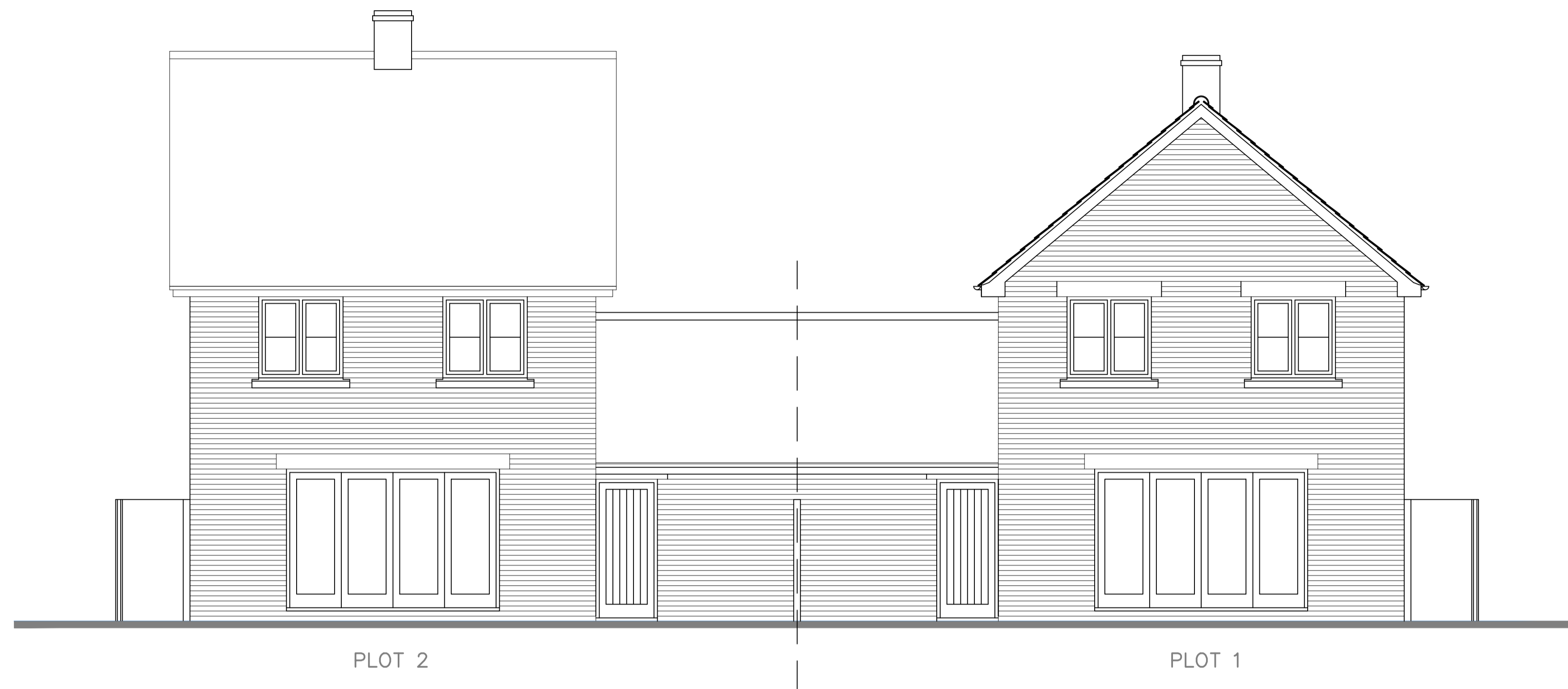
SOUTH-WEST (REAR) ELEVATION