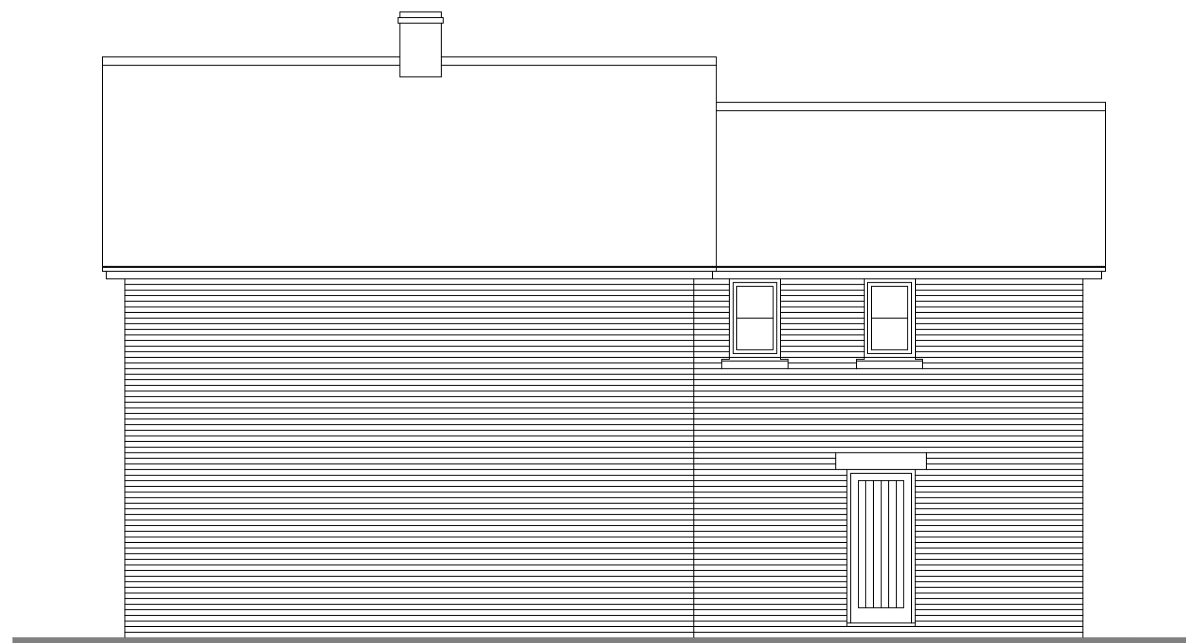
PLOT 1 SOUTH-EAST (SIDE) ELEVATION

RAINWATER GOODS TO BE BRETT MARTIN, OR EQUAL APPROVED, 'CASCADE' HEAVY PLASTIC SIMULATED CAST IRON RAINWATER GOODS AND FITTINGS, COLOUR 'CLASSIC BLACK'.