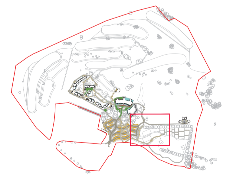
Location Plan Scale 1:10,000