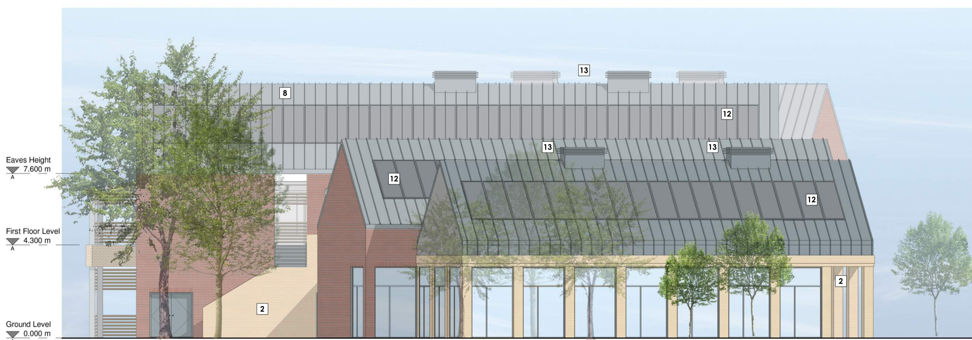
West Elevation Scale - 1 : 100