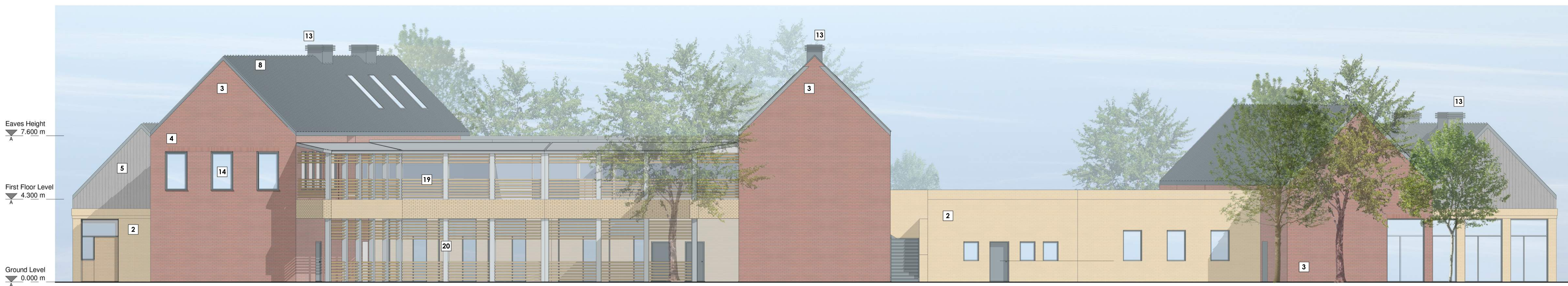
North Elevation Scale - 1 : 100