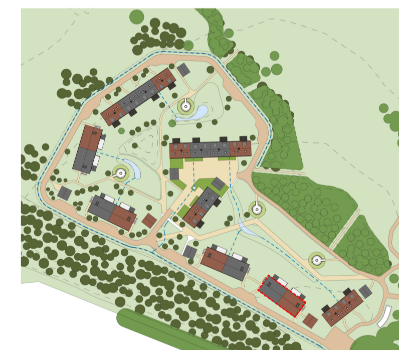
Key Plan - NTS

DATE • 25/05/18 DRAWN • LC SCALE • 1:100 @ A3 CHECKED • JB