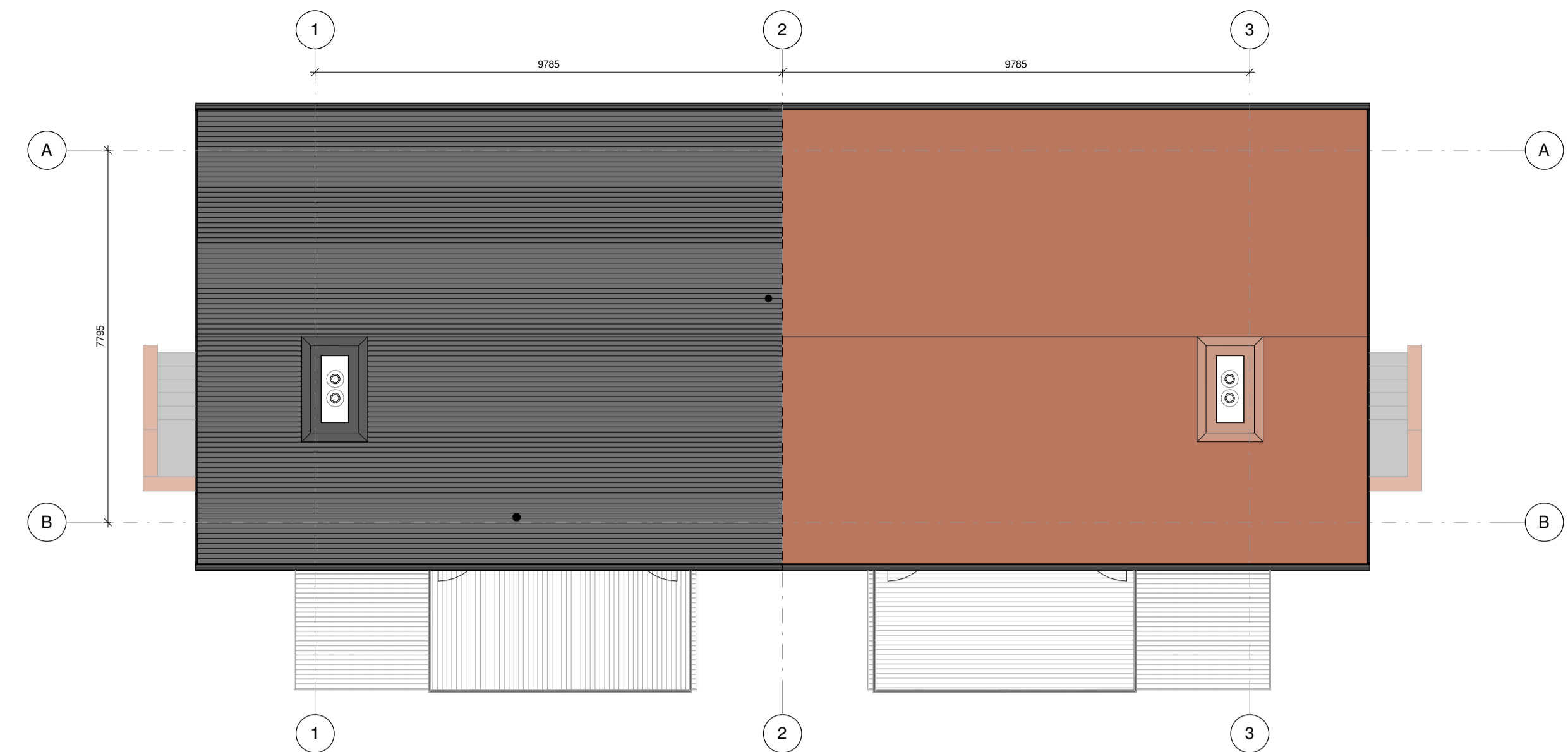
Roof Plan Scale - 1 : 100