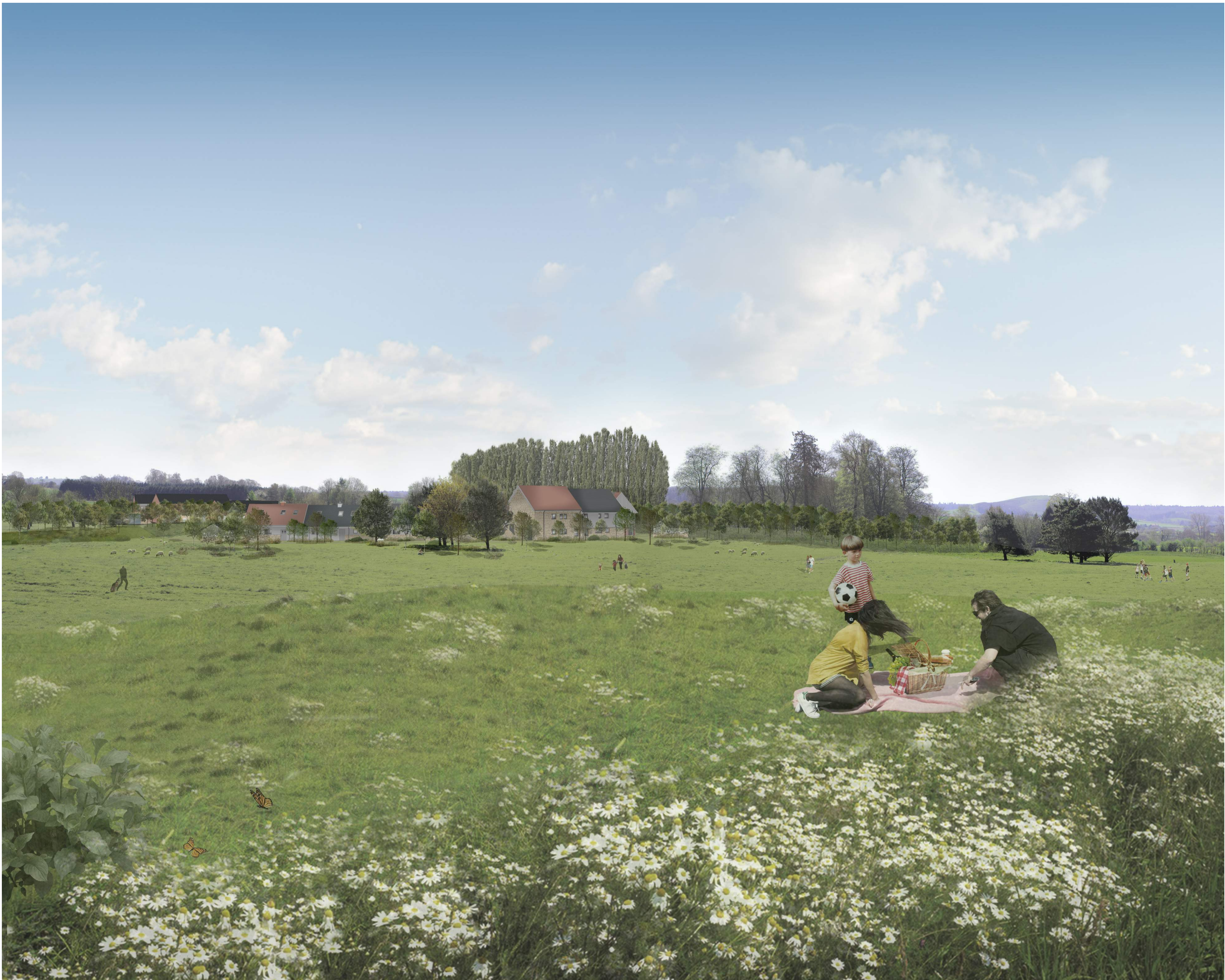
View Towards Holiday Accommodation from the North West